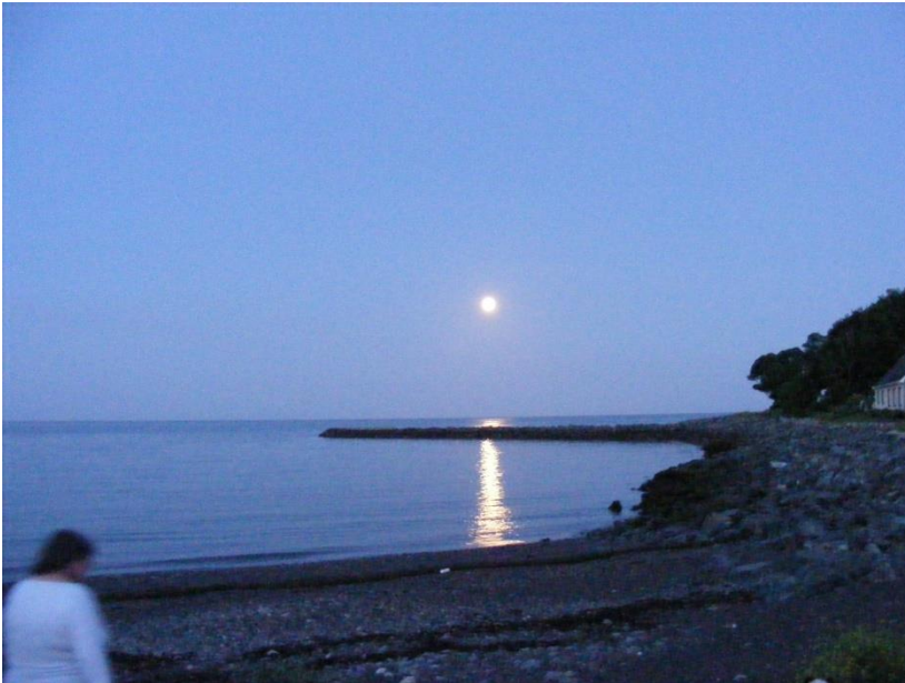
Moonrise in Garlieston

As the night drew on and got darker, we experienced moonrise across the bay. The stillness of the water can be seen in the reflections.