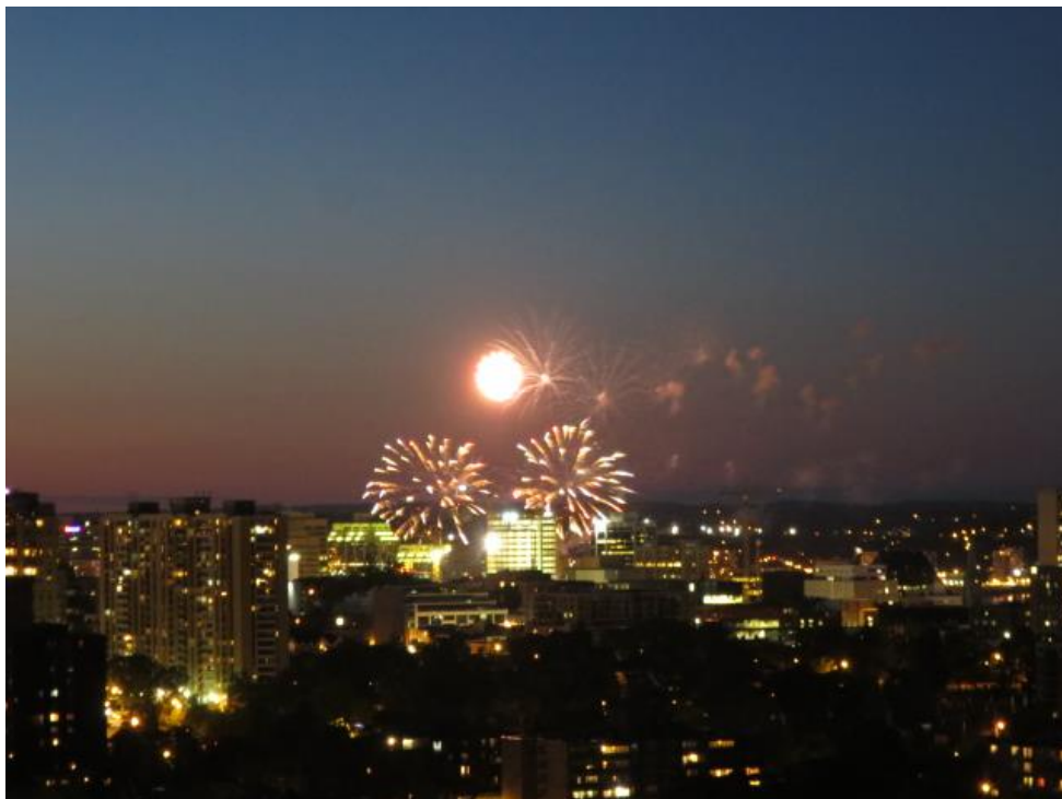
Over the city of Halifax, Nova Scotia, fireworks mark the celebration of Canada Day, 2015 July 1, 148 years after Confederation.