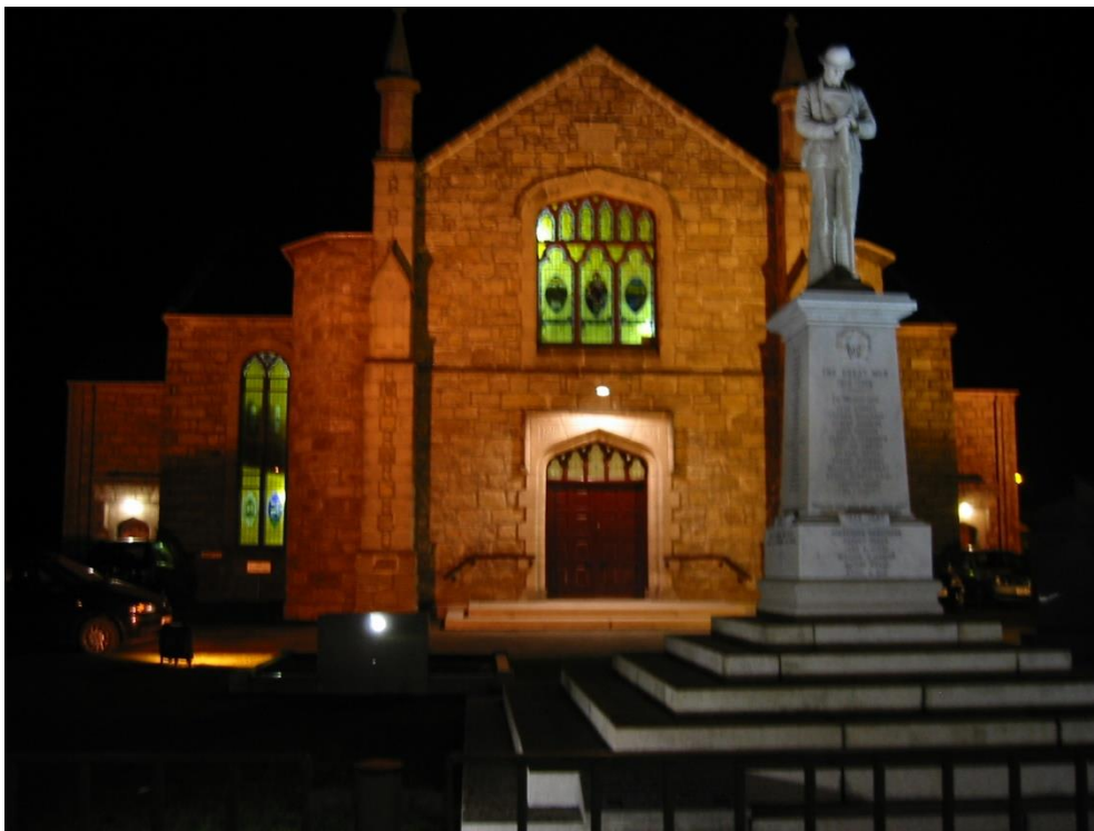
Figure 1 Mournie Presbyterian Church in Kilkeel