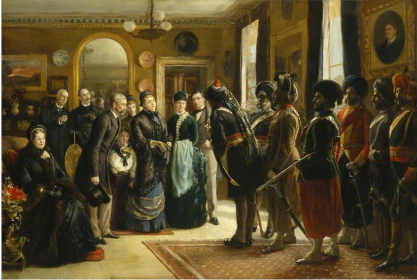
The Duke and Duchess of Teck receiving officers from the India Contingent 1882